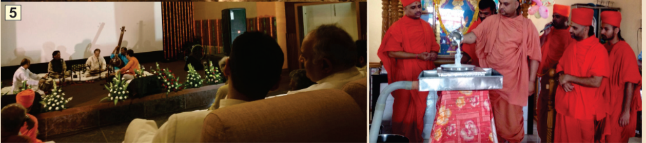
(1) H.H. Shri Mota Maharaj offering blessings and offering consolation to an old devotee alongwith saints of Bhuj temple in Medical Camp organized on the occasion of Patotsav of Bhuj temple. (2) A long queue in the temple and people availing the benefit of Medical Camp. (3) H.H. Shri Mota Maharaj and British High Commissioner on the occasion of Medical Camp. (4) H.H. Shri Mota Maharaj performing tree-plantation in Shree Swaminarayan Museum on the occasion of His Prakatya-Deen. (5) H.H. Shri Mota Maharaj and H.H. Shri Acharya Maharaj relishing classical music in Shree Swaminarayan Museum. (6) H.H. Shri Acharya Maharaj observing P.S.M. Hospital of Shree Narnarayandev Desh situated at Kalol. (7) Saints of Jetalpur and Anjali temple performing Abhishek of Thakorji on the occasion of Patotsav of Merani Muvadi (Panchmahal) temple.