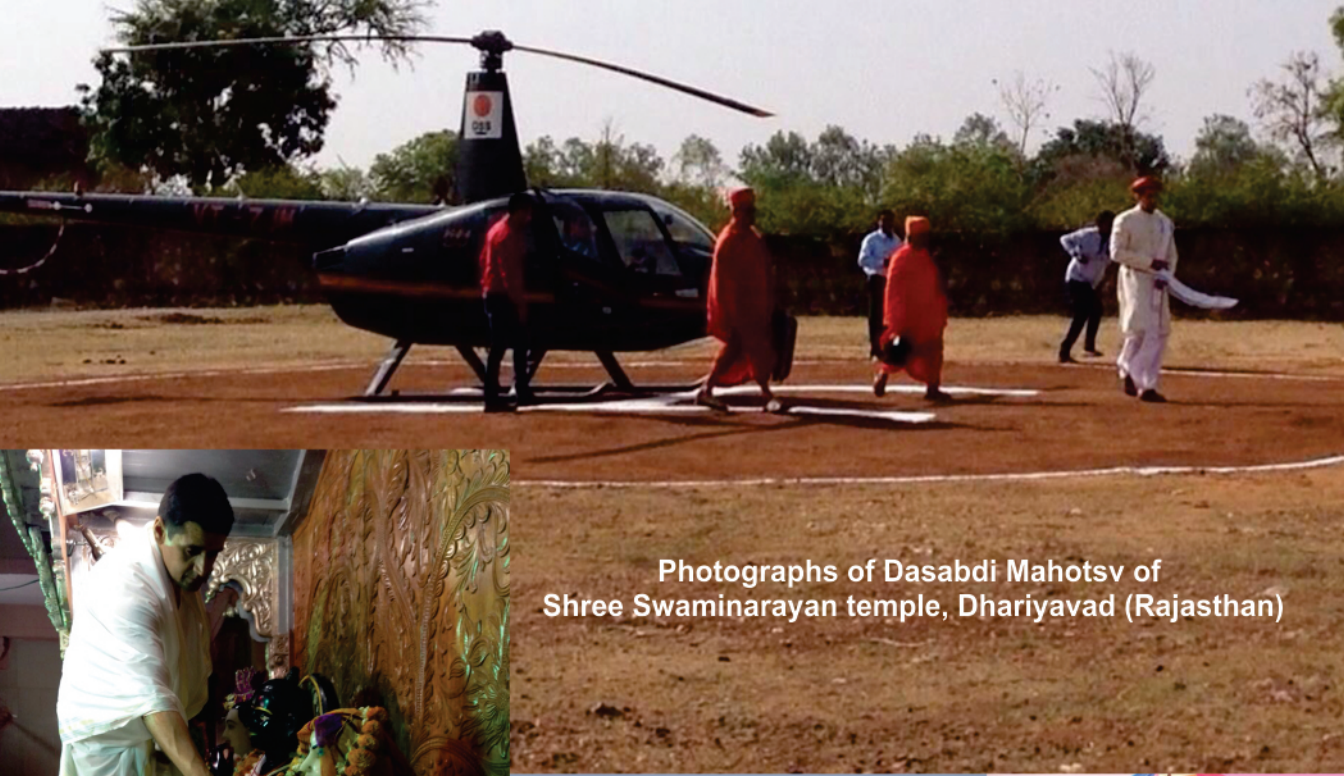
Photographs of Dasabdi Mahotsv of Shree Swaminarayan temple, Dhariyavad (Rajasthan)